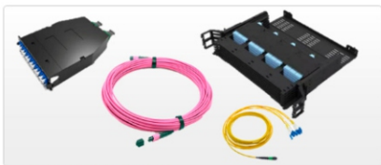
Fiber Optic Systems