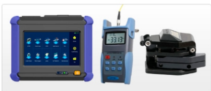
TEST AND TOOLS