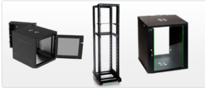
Cabinets and Enclosures