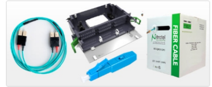
Fiber Optic Systems