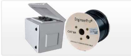
Outdoor Cabling Systems