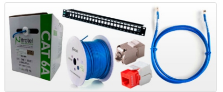
Copper Connectivity Category 6A